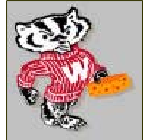
Bucky and his chunk of Cheddar Cheese!