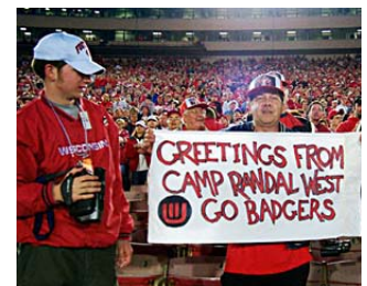
Scenes from Camp Randall West 2000

"I decided to sacrifice body, mind, and soul, (and what was left of my sanity) and do both."