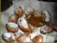
Deep Fried Stout Beer Cupcakes