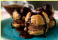
Nutella Ice Cream Sandwiches