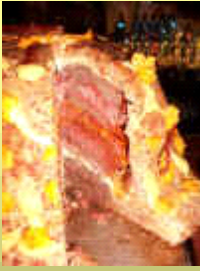
Meta Meat Cake

There's been no lack of food and drink lately, so let's get on with it. Here's why you might be fat: