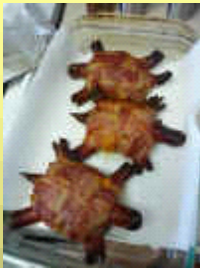
Bacon Cheese Turtleburgers

So, what is on the menu to keep us Fat and Happy?