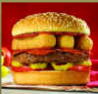
Red Robin Italian Burger